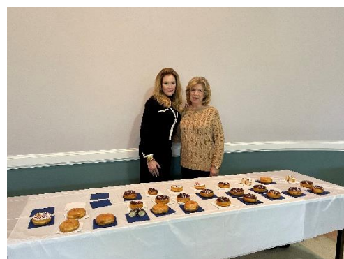
CDA served coffee & donuts

"What does the Lord your God ask you, But to fear the Lord your God, To walk in all the ways To love Him, To serve the Lord your God, With all your heart and soul" --Deuteronomy 10:12